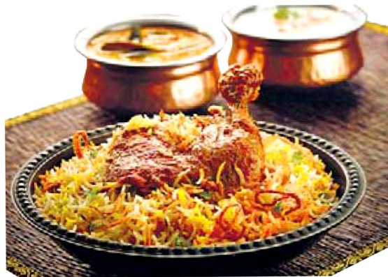
DELECTABLE Chicken biryani

The flavour, taste and aroma of 'Paradise Biryani' is controlled by the centralised kitchen where seasoned chefs prepare the 'biryani' and other dishes in the same traditional and authentic style that have become legendary from the days of the Nizams. The recipe has been passed down from generations and the team ensures that the ingredients used is